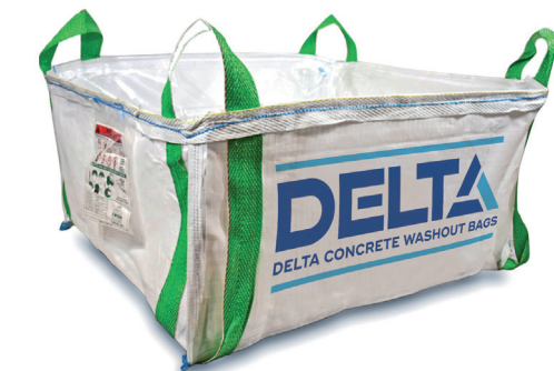
Delta Open Washout Bag

The Delta Washout bag is the industry leader in concrete washout and containment. Delta Washout Bags can safely handle the most difficult cleanout and washout procedures. Each lined Delta bag completely contains washout water and concrete material.