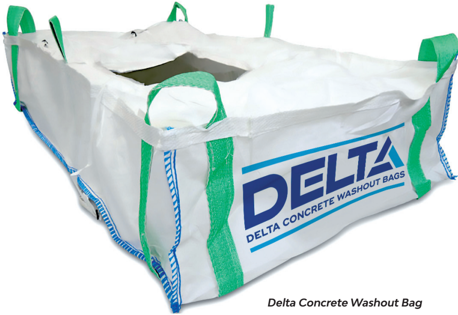
Delta Concrete Washout Bag